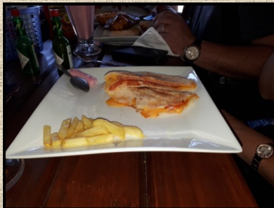
Stuffed Pita Bread