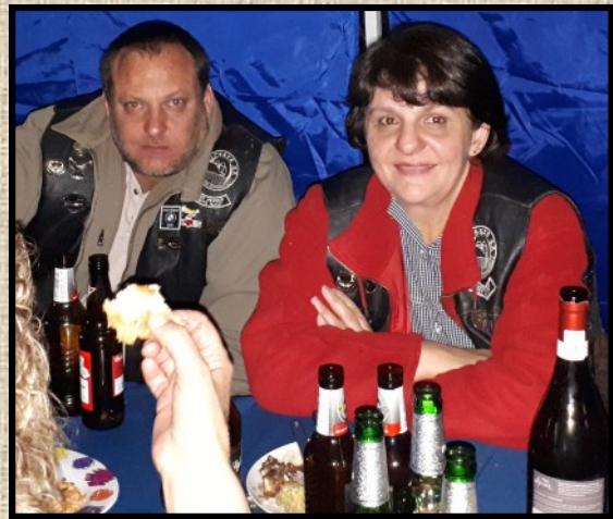
The Chapter's large 6m x 3m gazebo had been erected and sides hung to shield the prevailing August winds from the members.