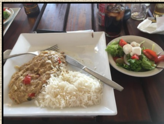
Sunday Special: Chicken Ala King & fresh salad