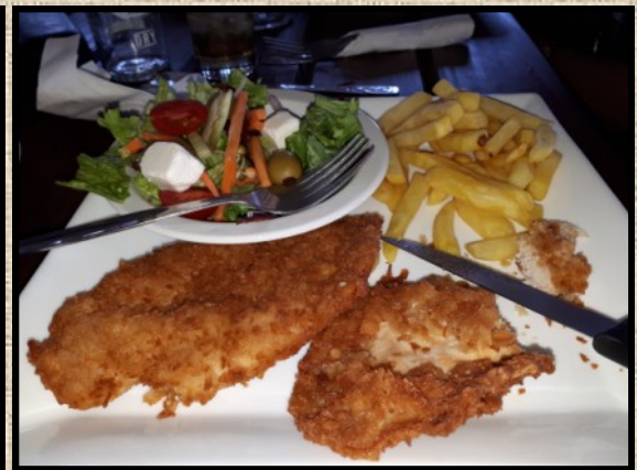
Crumbed Chicken Schnitzel